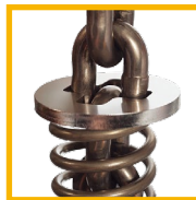
Stainless steel chain spring & limit plate