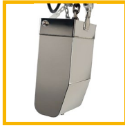
Stainless steel chain container