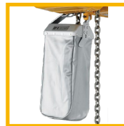
Canvas chain container