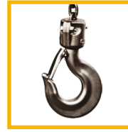
Stainless steel hook