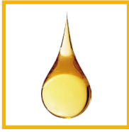
Food grade Oil & grease