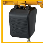
Plastic chain container