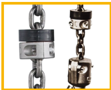
Stainless steel rubber cushion & Nickel plated stopper on no-load side/load side