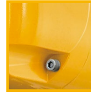
Stainless steel Bolt & nut