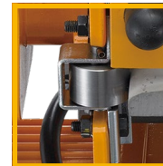
Stainless steel guide roller